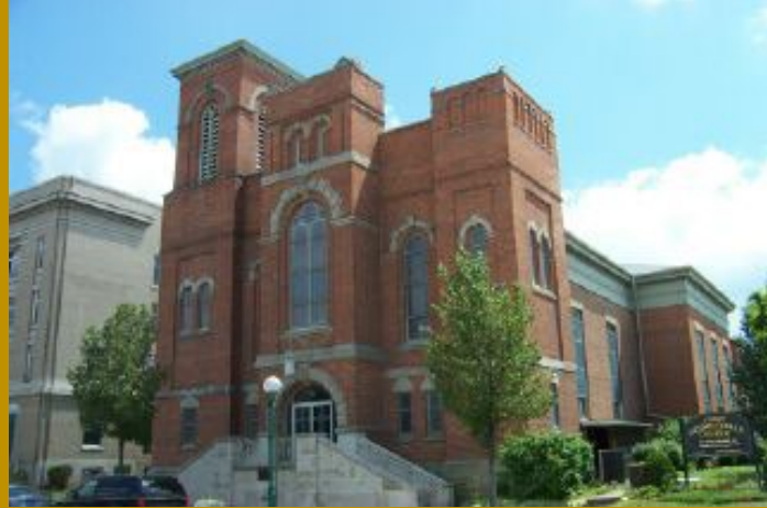
156 East Maumee Street, Adrian

WHEREAS, historic structures are not only tangible evidence of important national history, but tell the stories of generations of citizens of Lenawee County and their triumph and tragedies as well; and